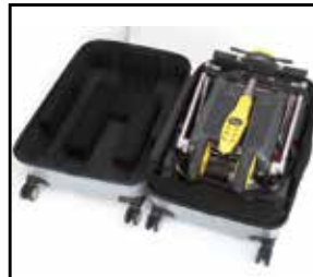
Hard Case Open