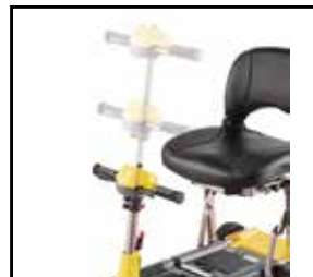
Height adjustable tiller